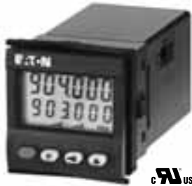
Cat. No. E5-148-C2421